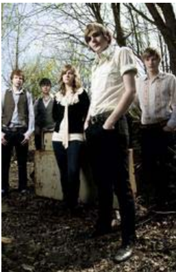
Kill It Kid