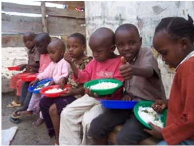
Kichijo Orphanage Children