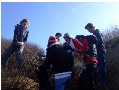
New Volunteering: Just V