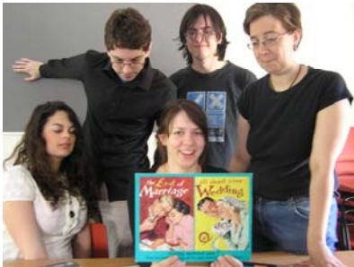
Enduring Love Team

In May BSU Online told you about ‘Enduring Love’, a joint project between Bath Spa University and Relate to mark the counselling organisation’s 70 th birthday.