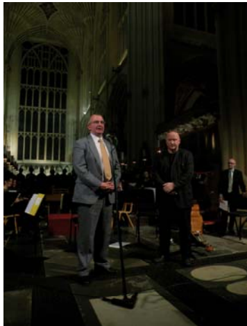
The Vice Chancellor with Gavin Bryars in Bath Abbey