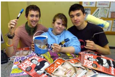
Student Volunteers at the Big Issue

You can view some of Jan's designs at www.janknibbs.com