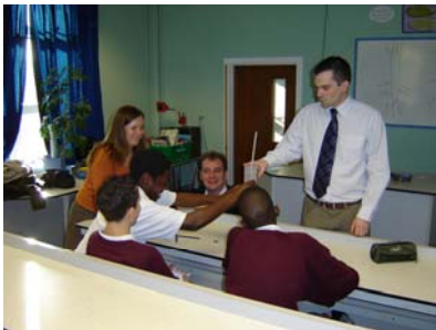
'Saturation' Teaching at Culverhay School

Schools are sometimes criticised over the size of their classes and lack of individual attention for pupils. Bath Spa University has now come up with an answer – saturation teaching. Large groups of the University's trainee teachers have been drafted into the same classroom all at the same time to help 14-year-old children at a comprehensive school in Bath.